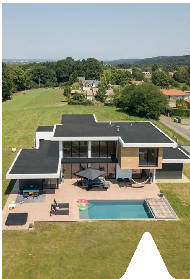
Individual house, Bernac-Debat (France) - Architect: Atelier Scenario - Product: EPDM membrane

VM Building Solutions® - 09/2024 - © VM Building Solutions