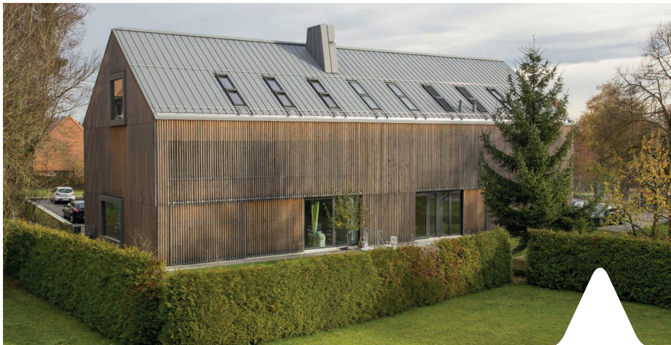
Gemeindeforum, Gampelen (Suisse) - Architect: Spaceshop architekten GmbH, Biel - Product: VMZINC