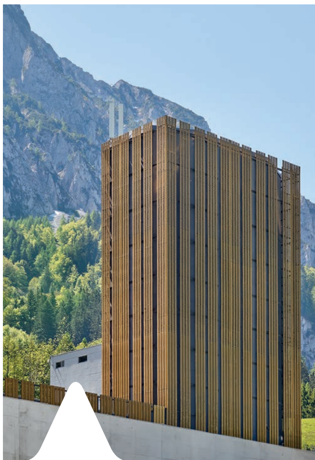
Bosruck Tunnel, Bosruck, Austria - Architect: Riepl Riepl Architekten - Product: Nordic Copper